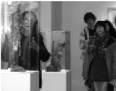
League Partnerships serve schools and teachers by engaging them in meaningful discussions while looking at original art in our galleries in preparation for in-depth hands-on workshops in our studios.

SPA – Professional Development – where teachers go to renew, recharge and replenish their artistic and teaching talents.